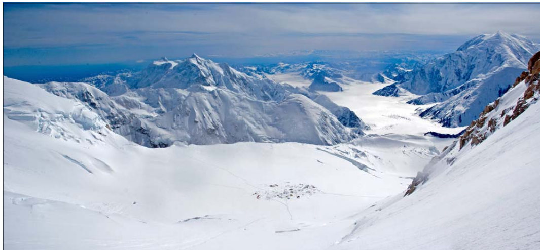
Camp 3, as seen from below the fixed lines at about 15,600 ft.

DAY 9: MOVE CAMP TO 14,200 FEET. This is usually a long, hard day. Camp 3 is located at the well equipped 14,200' camp. Loads are getting lighter and the air is getting thinner. Hopefully everyone will have enough energy left to help get camp in as we need to fortify this camp due to the possibility for fairly severe weather.