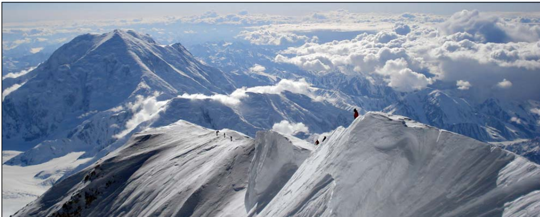
The amazing summit ridge, as seen from the top of North America.

***Summit Day is serious. The weather needs to be good and everyone attempting the summit needs to have demonstrated that they can safely give it a shot . This is often the most grueling day of the expedition (some climbers say of their lives!). The guides have the ultimate decision as to when the team will make a summit bid. The guides also have the discretion to decide that a team member has not shown that he or she is capable to safely make a summit bid. Such occurrences are rare; but remember— your safety is our primary concern.