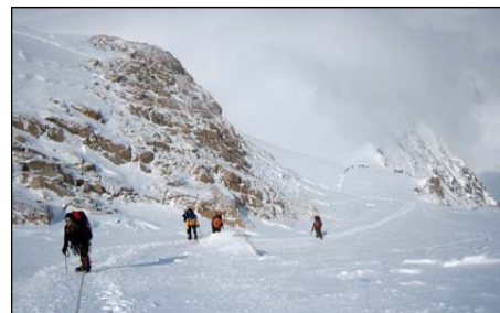
Team climbing above Motorcycle Hill

DAY 6: BACK-CARRY DAY. This is an "active rest day" during which we drop back down and pick up the cache we left down near Kahiltna Pass. It also helps give us another day to acclimatize before moving higher.