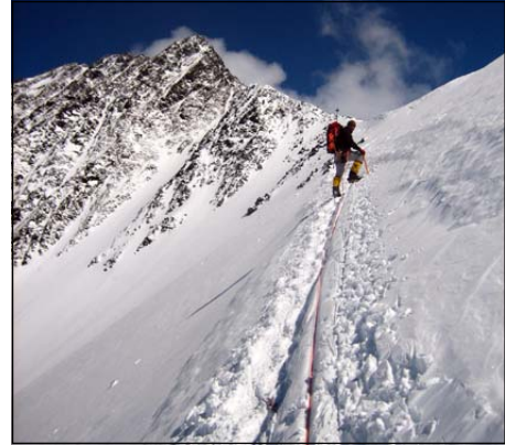
Ascending the Autobahn en route to the top!

Usually you will depart camp early (7-9 a.m.), climb up to Denali Pass (18,000') and follow the route past Arch Deacon's Tower and the Football Field to the slopes leading to the Summit Ridge. On this spectacular ridge you can often see down into the Ruth Glacier with views of beautiful peaks such as Mooses Tooth, Mt Huntington and Mt Hunter.