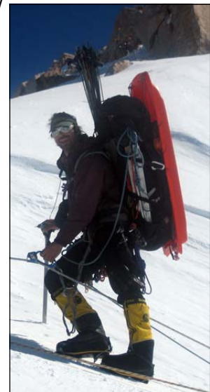
Practice at home, so you can better enjoy your climb!