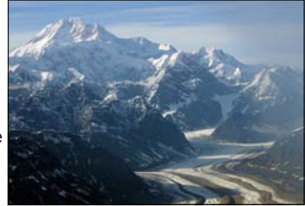
Denali, as seen from your flight in!

Thanks for joining Mountain Trip on what many consider the experience of a lifetime! This booklet contains an assortment of information to help you prepare for a safe and successful climb of Denali. Within these pages you'll find an expanded itinerary, gear list and training ideas, as well as some general information and history about Denali and Denali National Park. There are dozens of good books about Denali and a few not-so-good ones, so we have included a suggested reading list. Climbing a high mountain is hard work, requires proper preparation and can be incredibly rewarding. The more physically and mentally prepared you are for the trip, the more you will enjoy your experience.