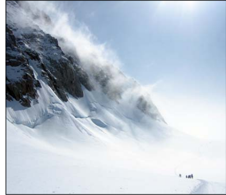
Climbers approaching Windy Corner on a windy day!

*** Please note that we have not planned on a "real" rest day before this point. 30+ years of guiding Denali has taught us that climbers fit enough to safely climb the upper mountain do not need rest days below Camp 3.